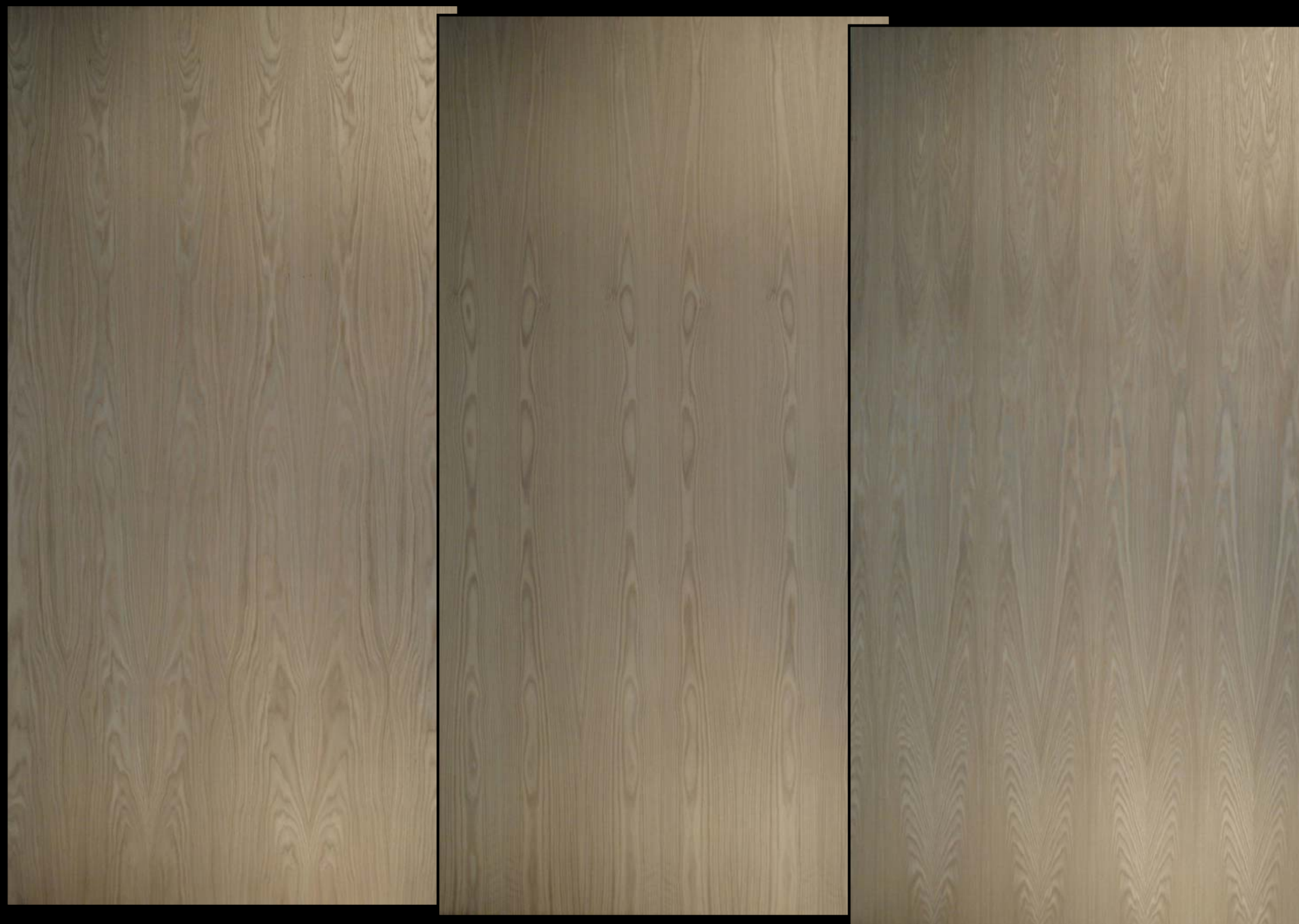
FS WHITE OAK EXECUTIVE