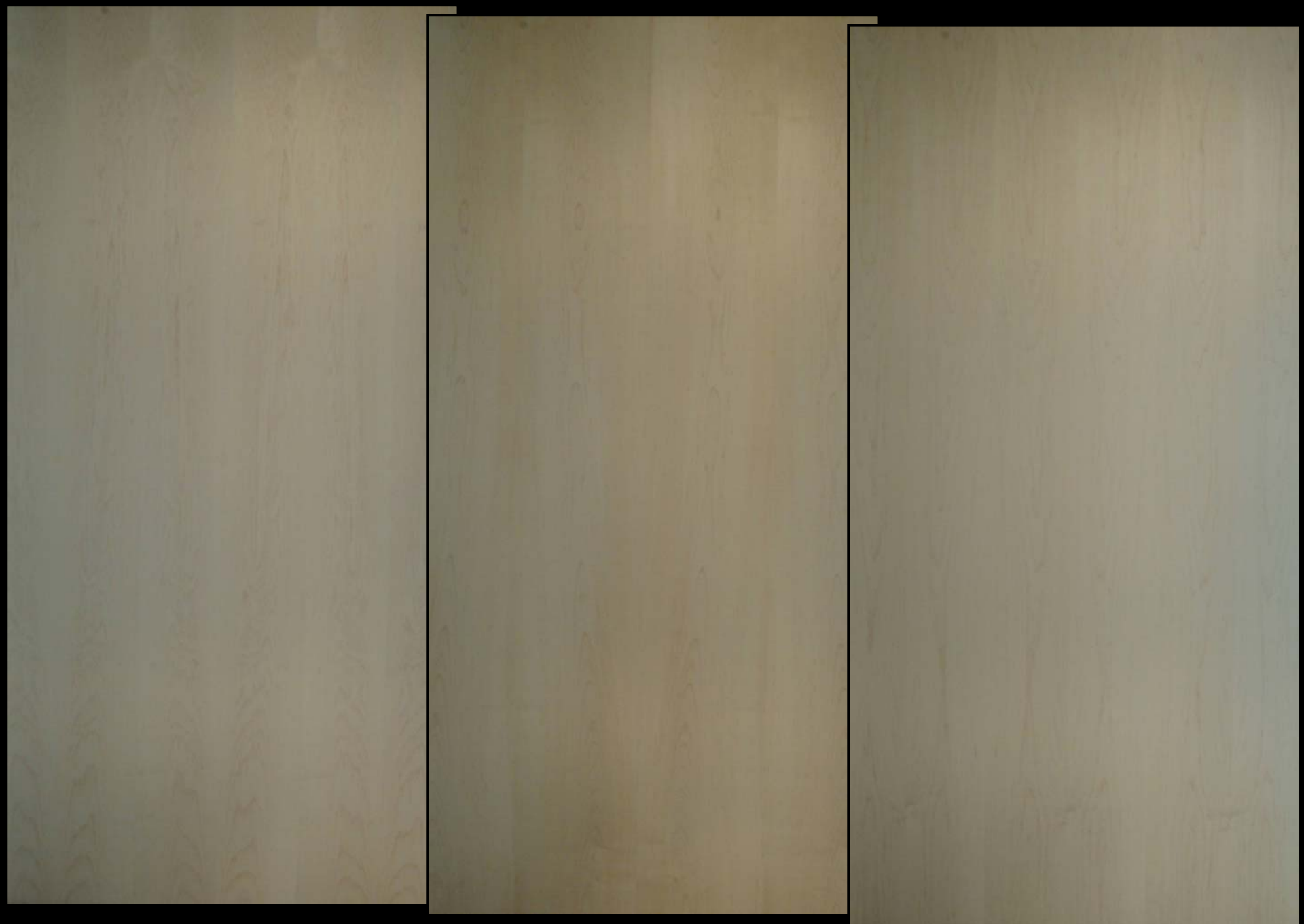
FS MAPLE PLATINUM