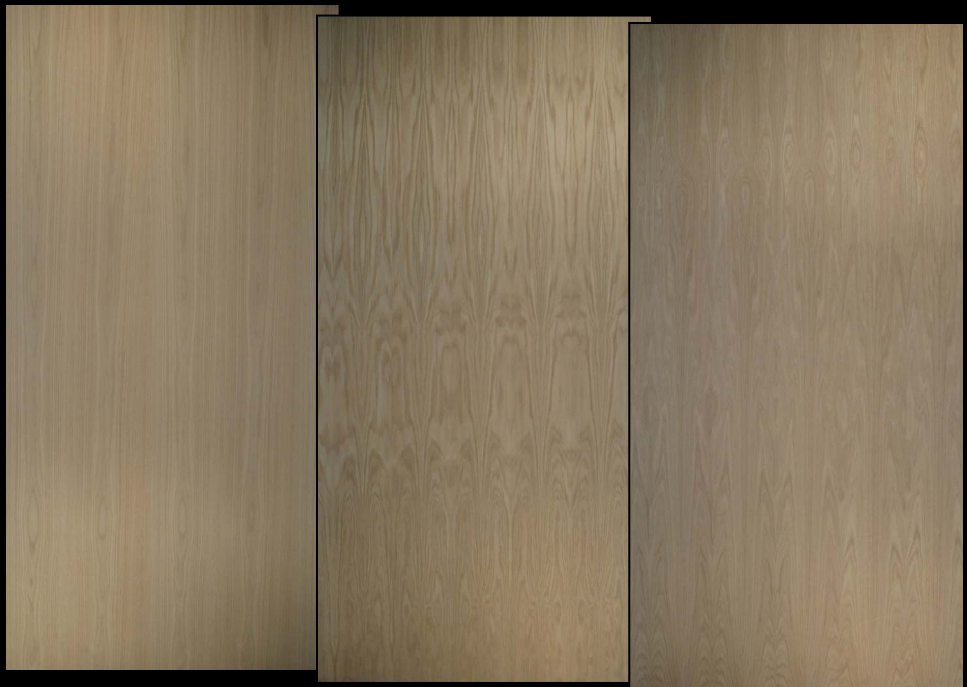
FS WHITE OAK PERFORMANCE