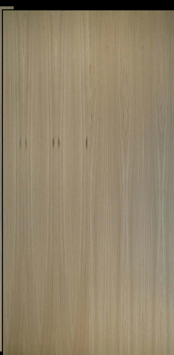
FS RED OAK BACK #1