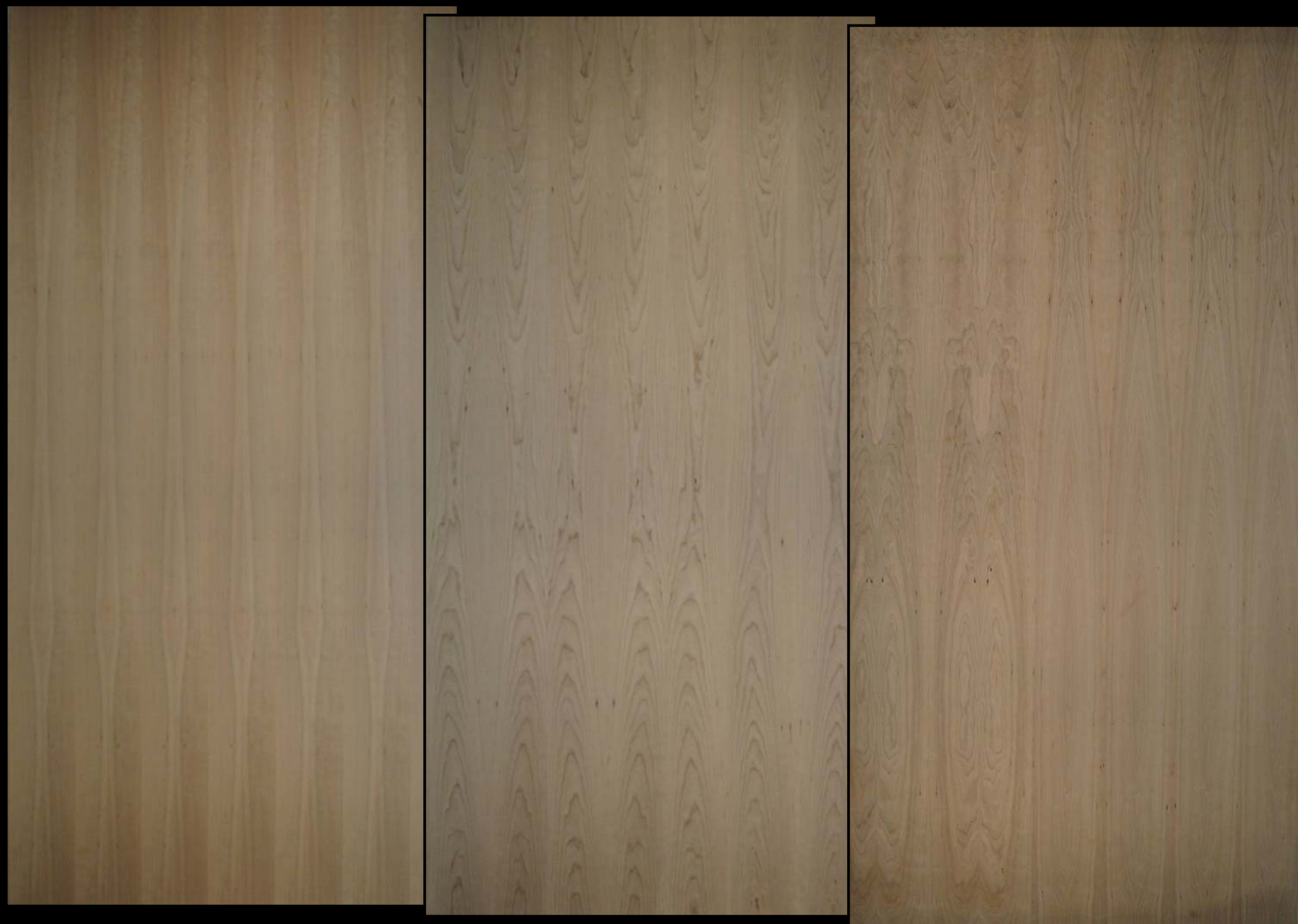
FS CHERRY BACK #1