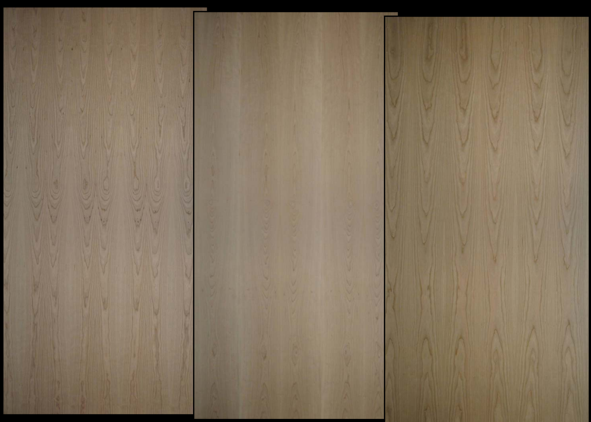
FS CHERRY PLATINUM