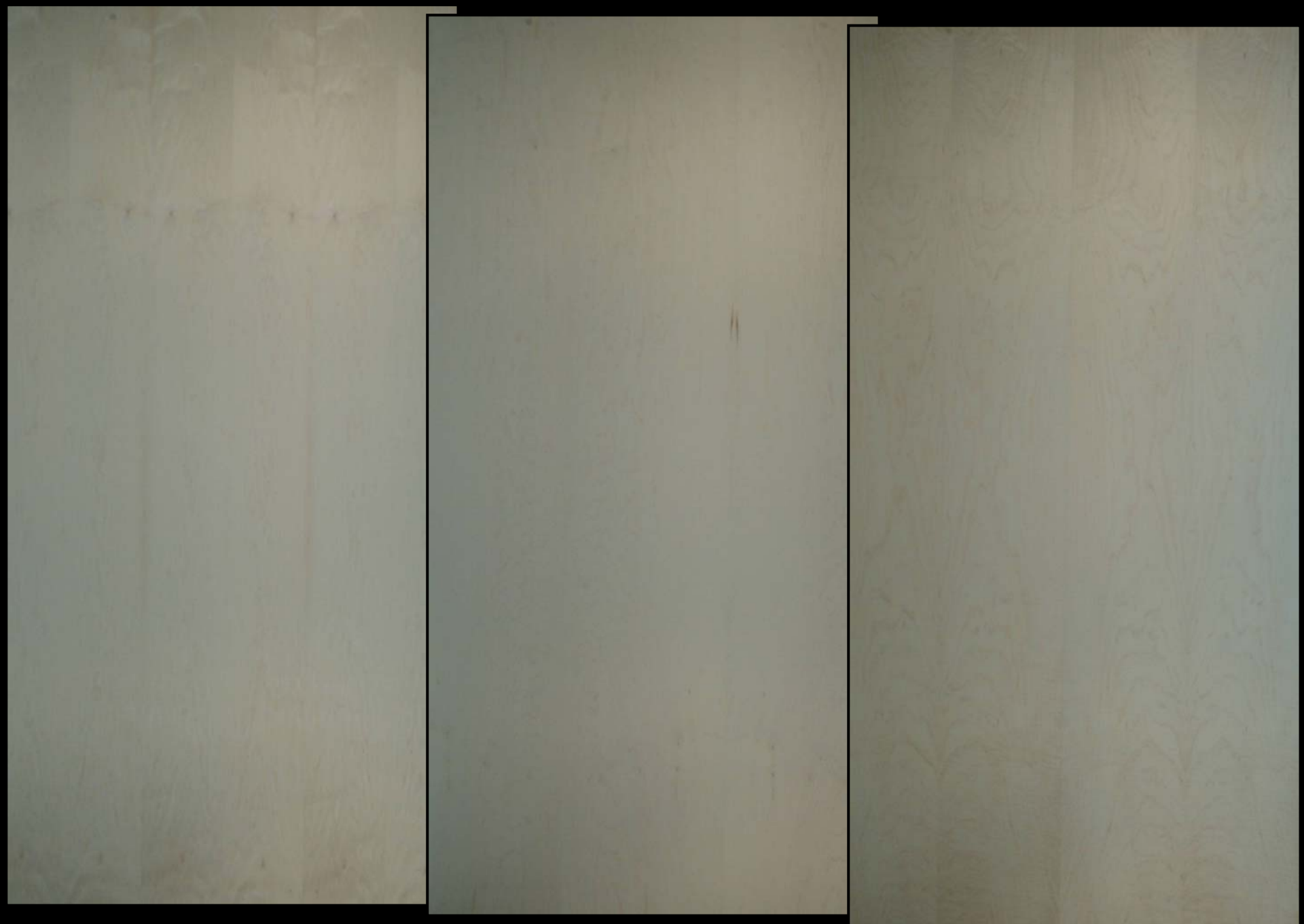
FS MAPLE EXECUTIVE