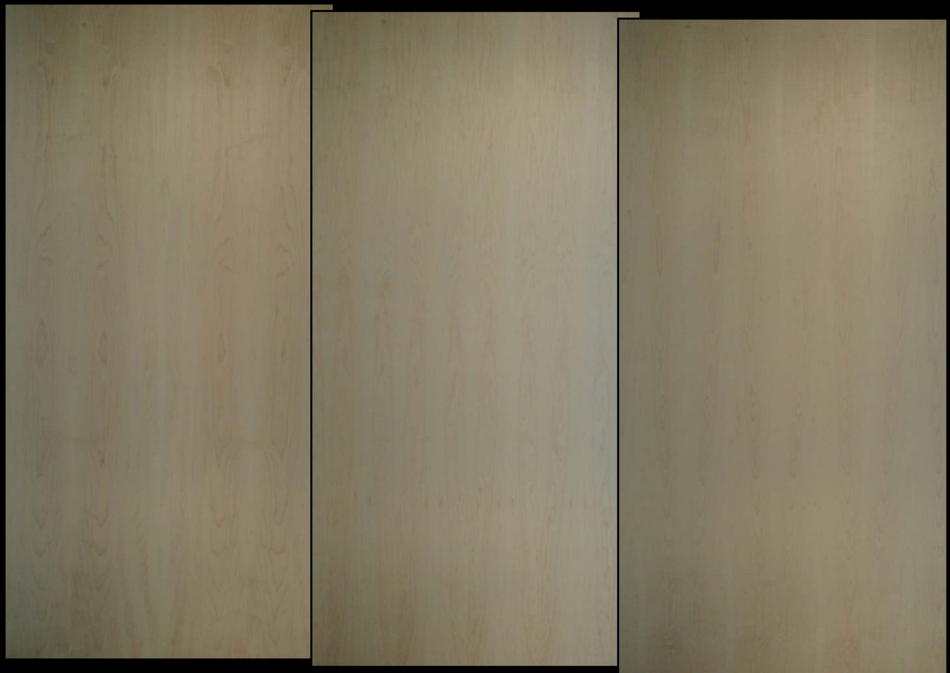
FS MAPLE PLATINUM