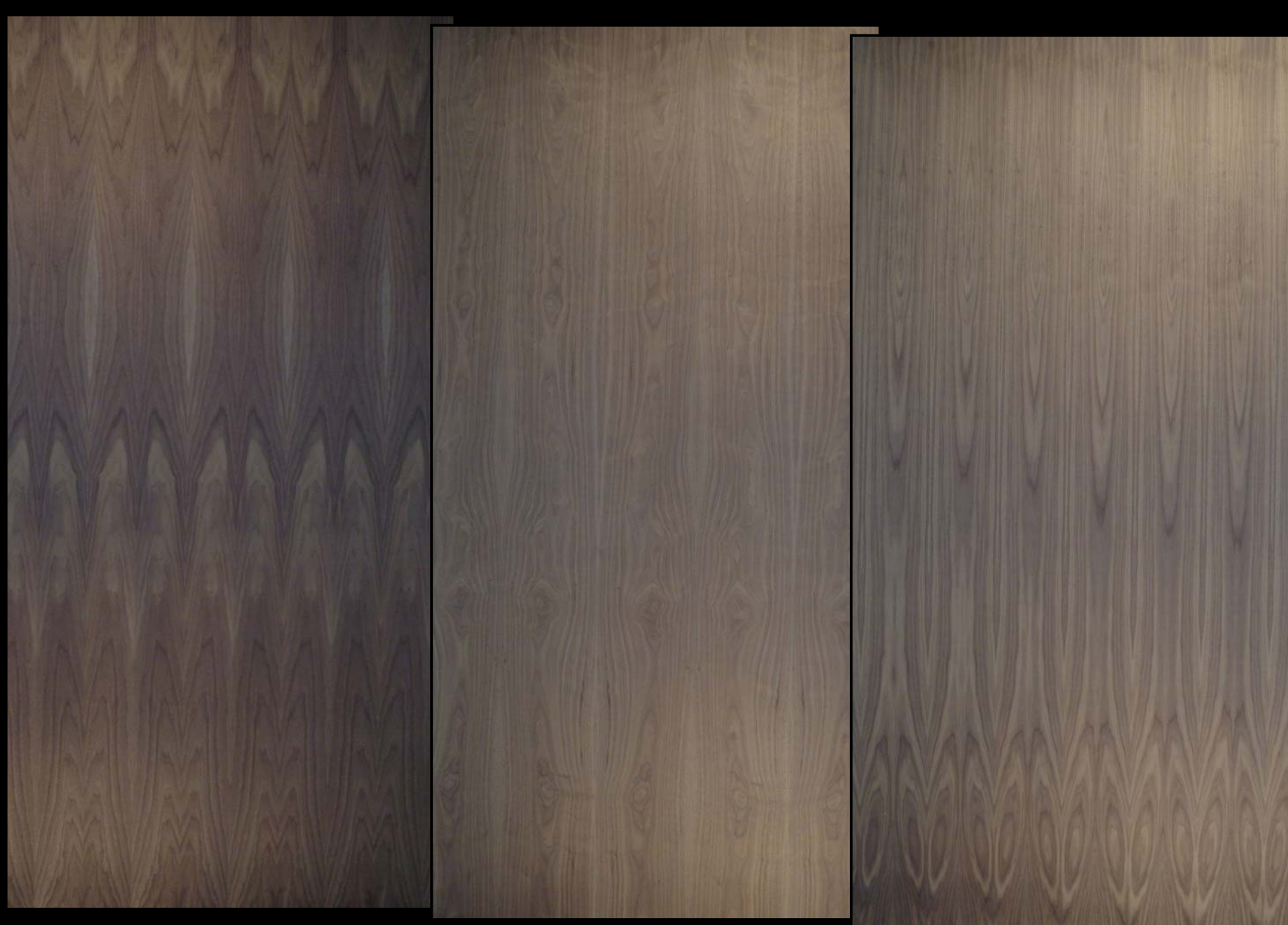
FS WALNUT PERFORMANCE