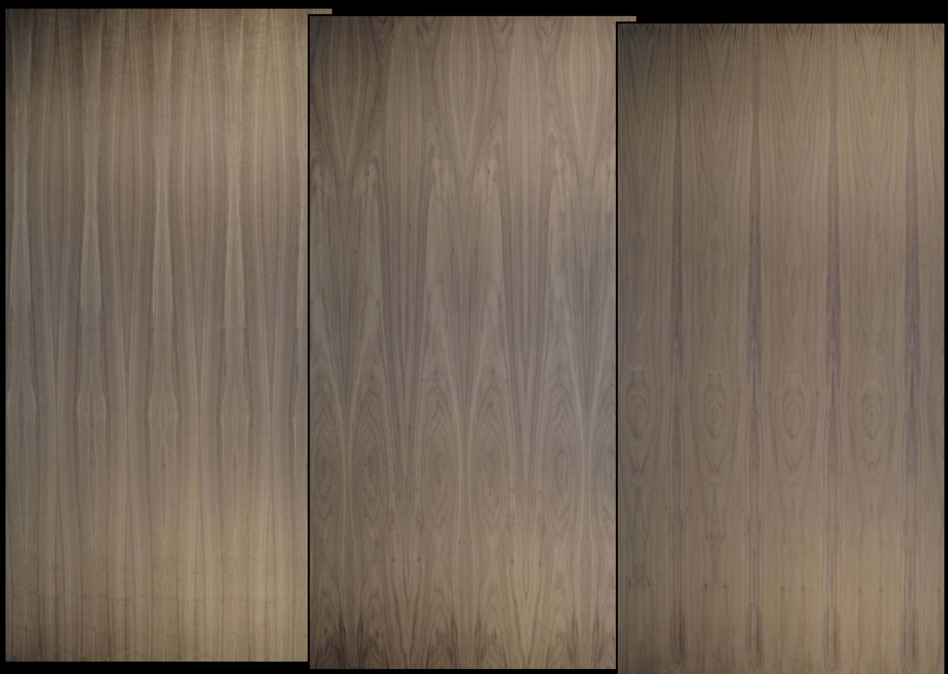
FS WALNUT EXECUTIVE