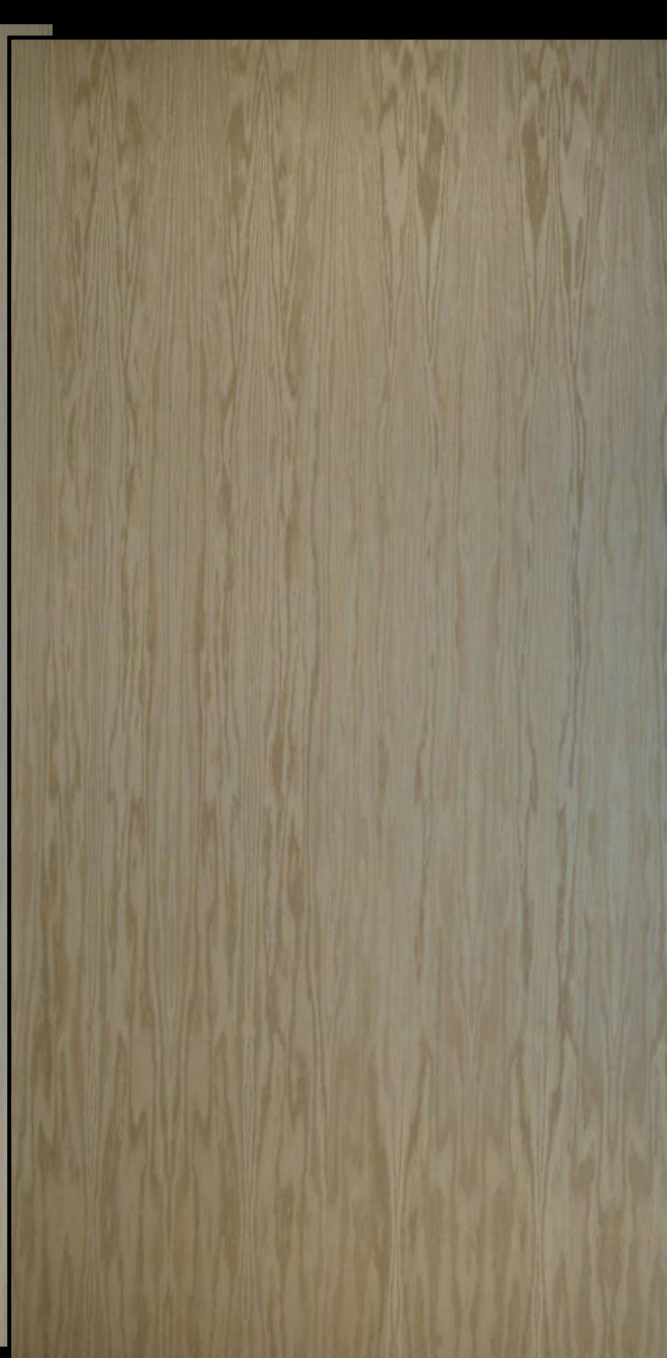
FS RED OAK EXECUTIVE