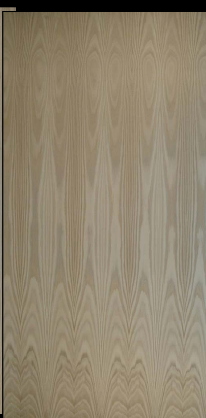
FS RED OAK PLATINUM