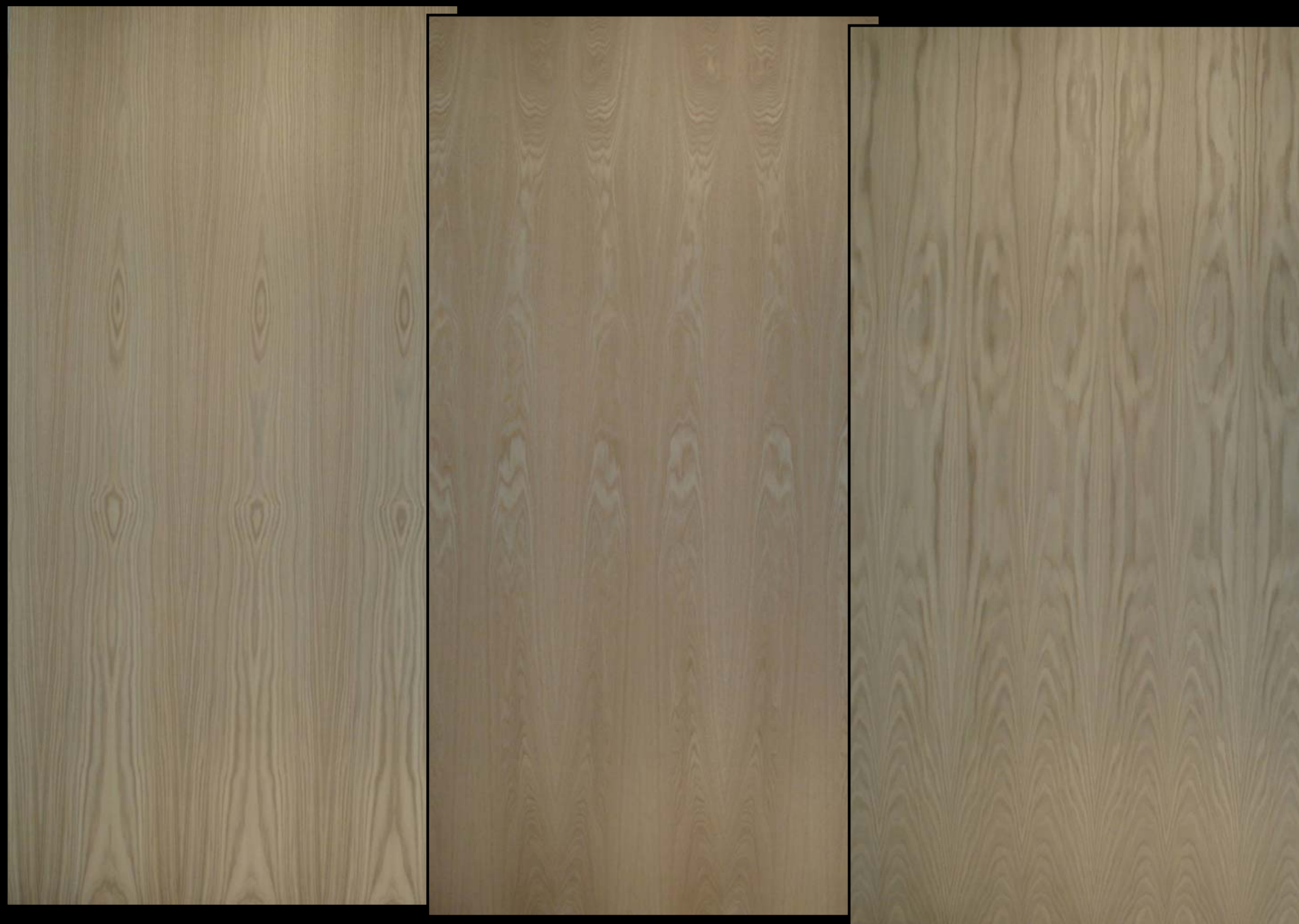
FS WHITE OAK PLATINUM