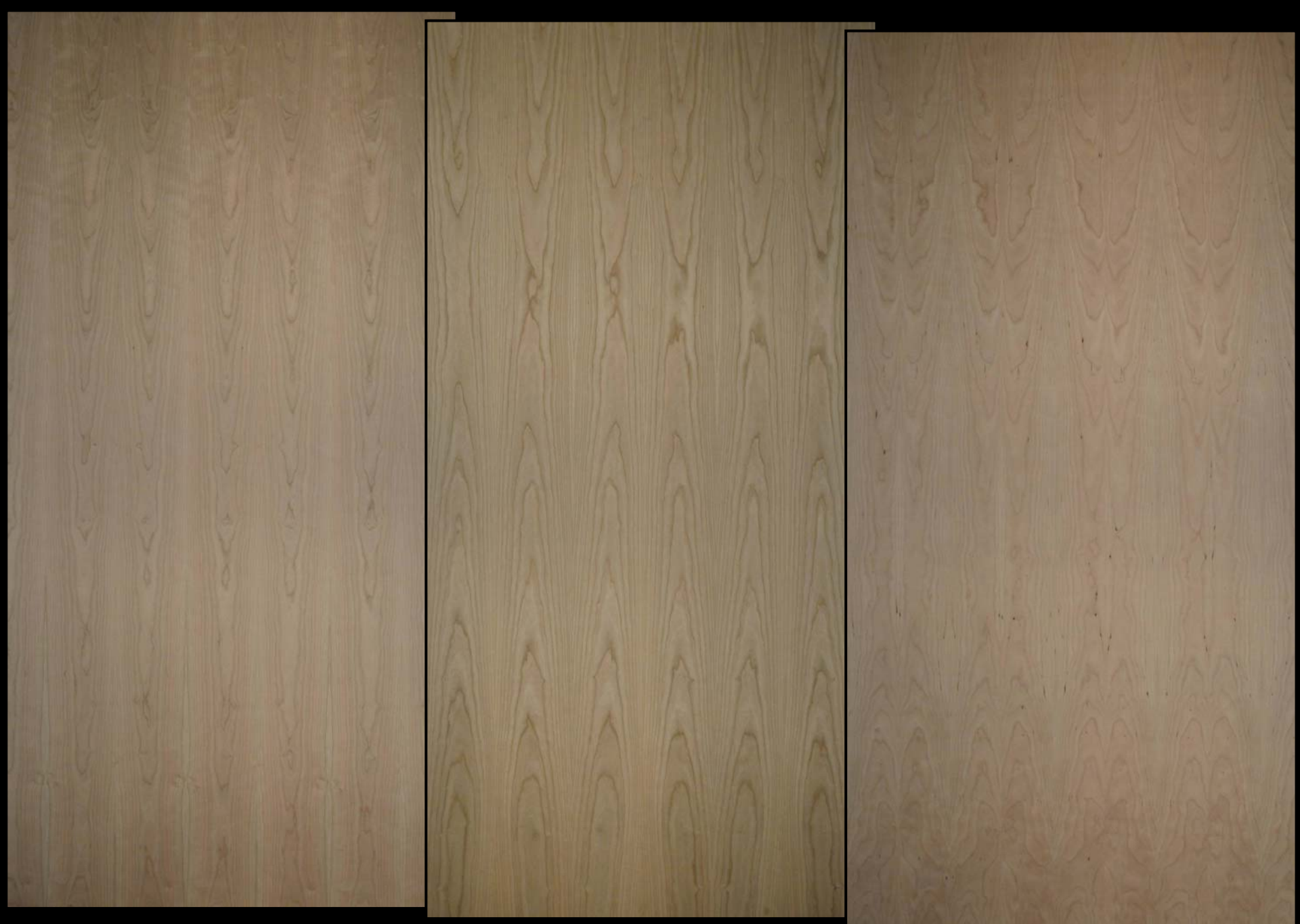
FS CHERRY EXECUTIVE