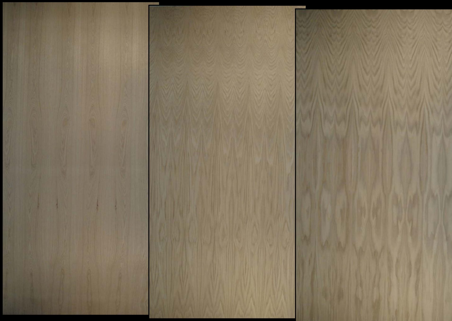
FS WHITE OAK PERFORMANCE