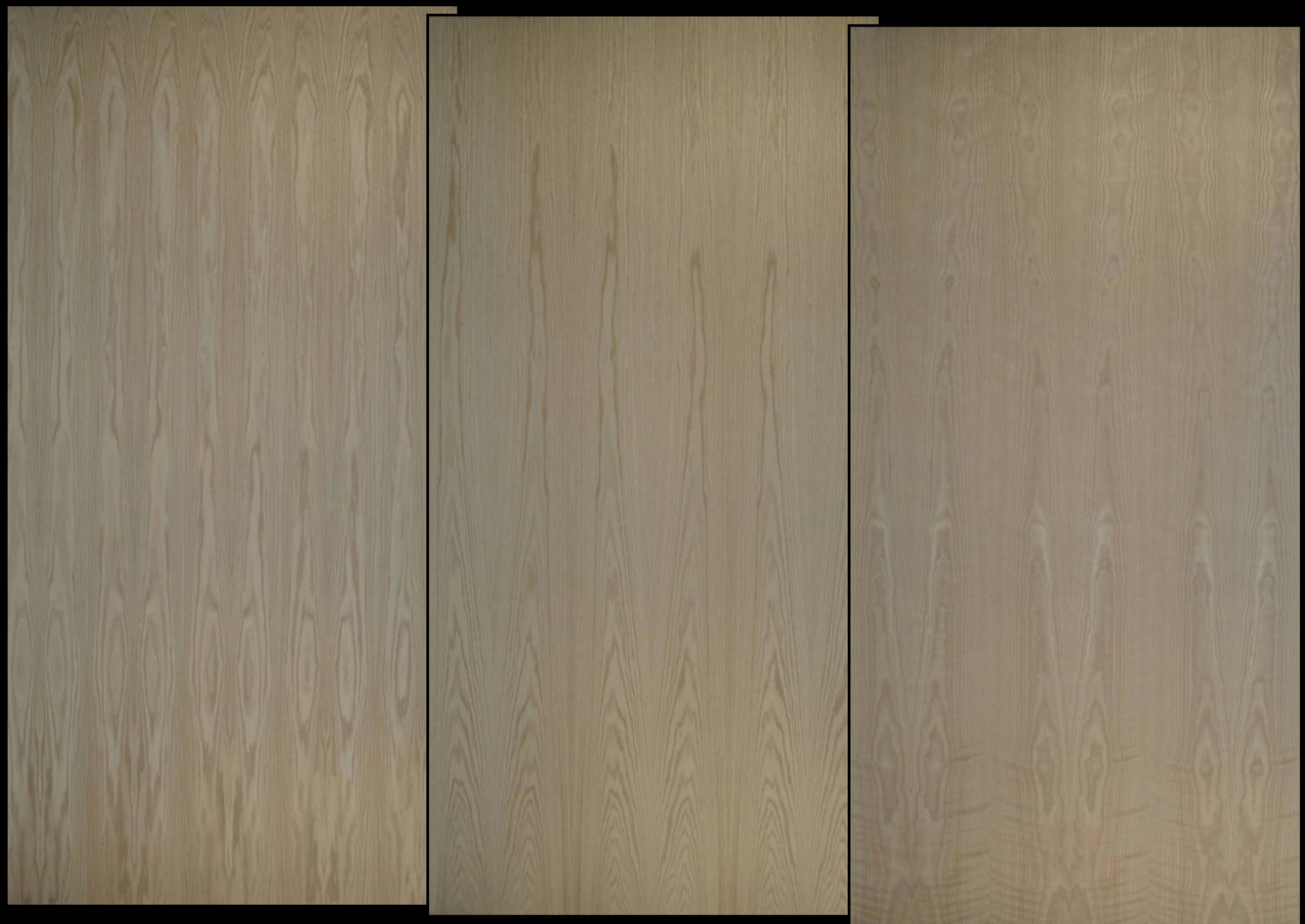
FS RED OAK PLATINUM