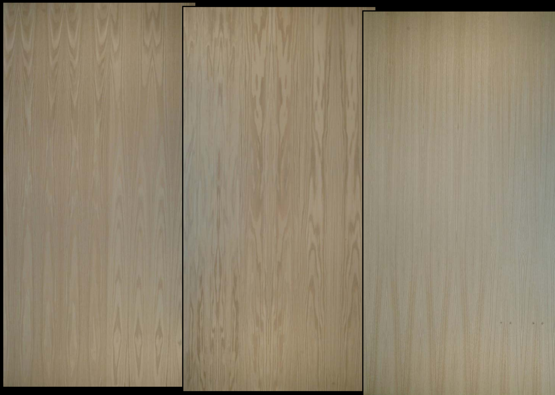
FS RED OAK PERFORMANCE