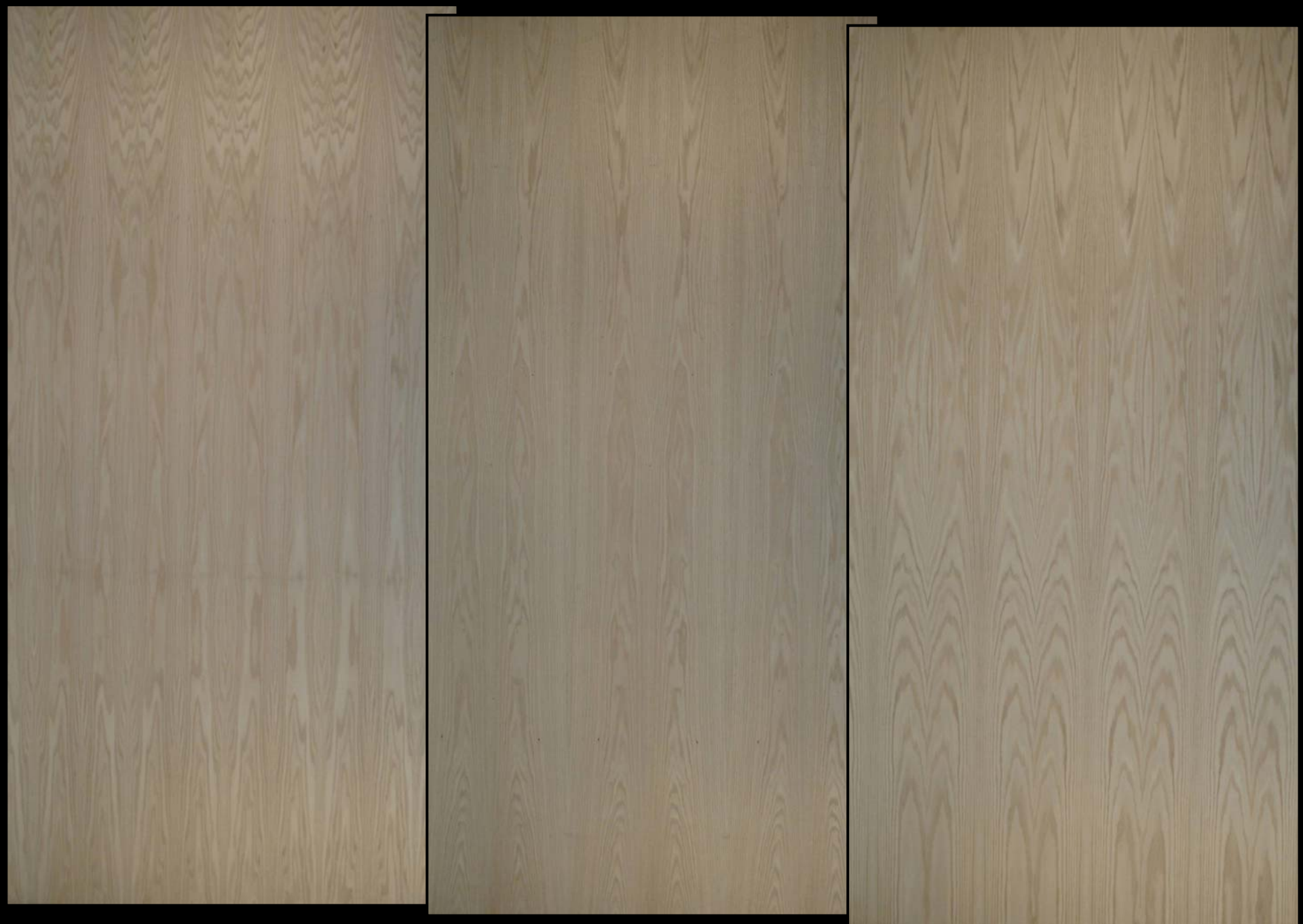
FS RED OAK EXECUTIVE