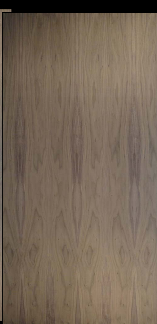
FS WALNUT EXECUTIVE