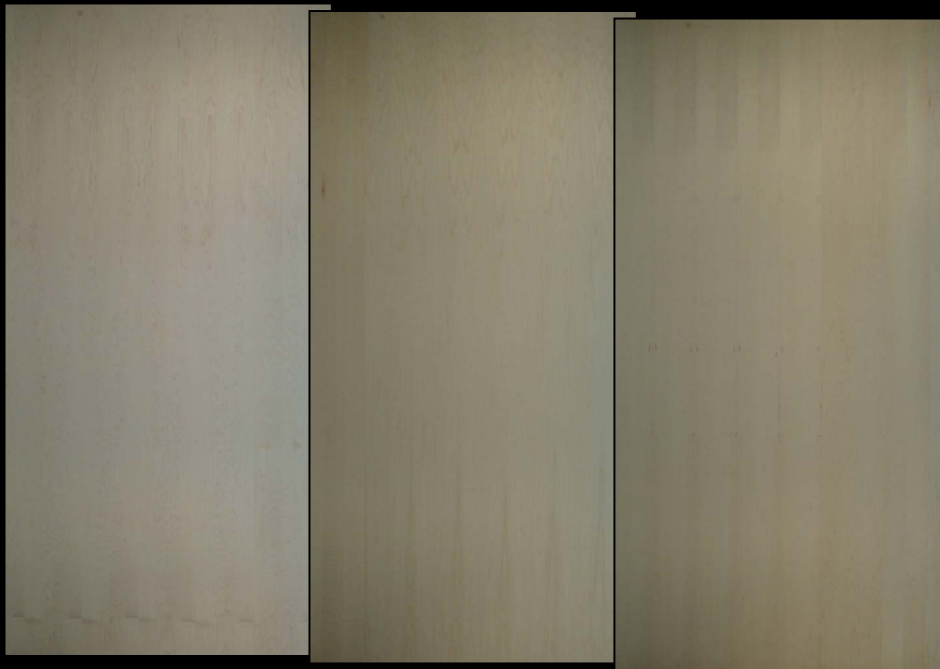
FS MAPLE BACK #1