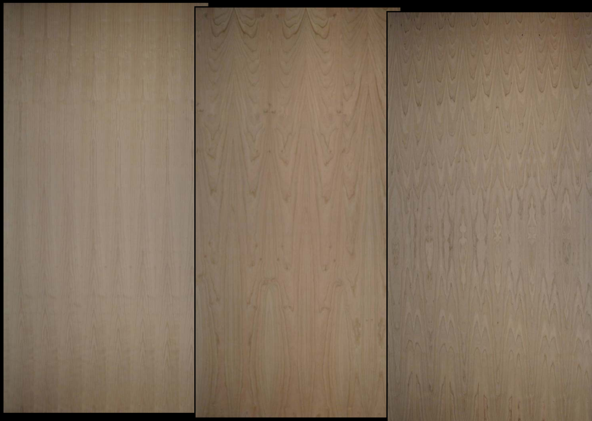
FS CHERRY PERFORMANCE