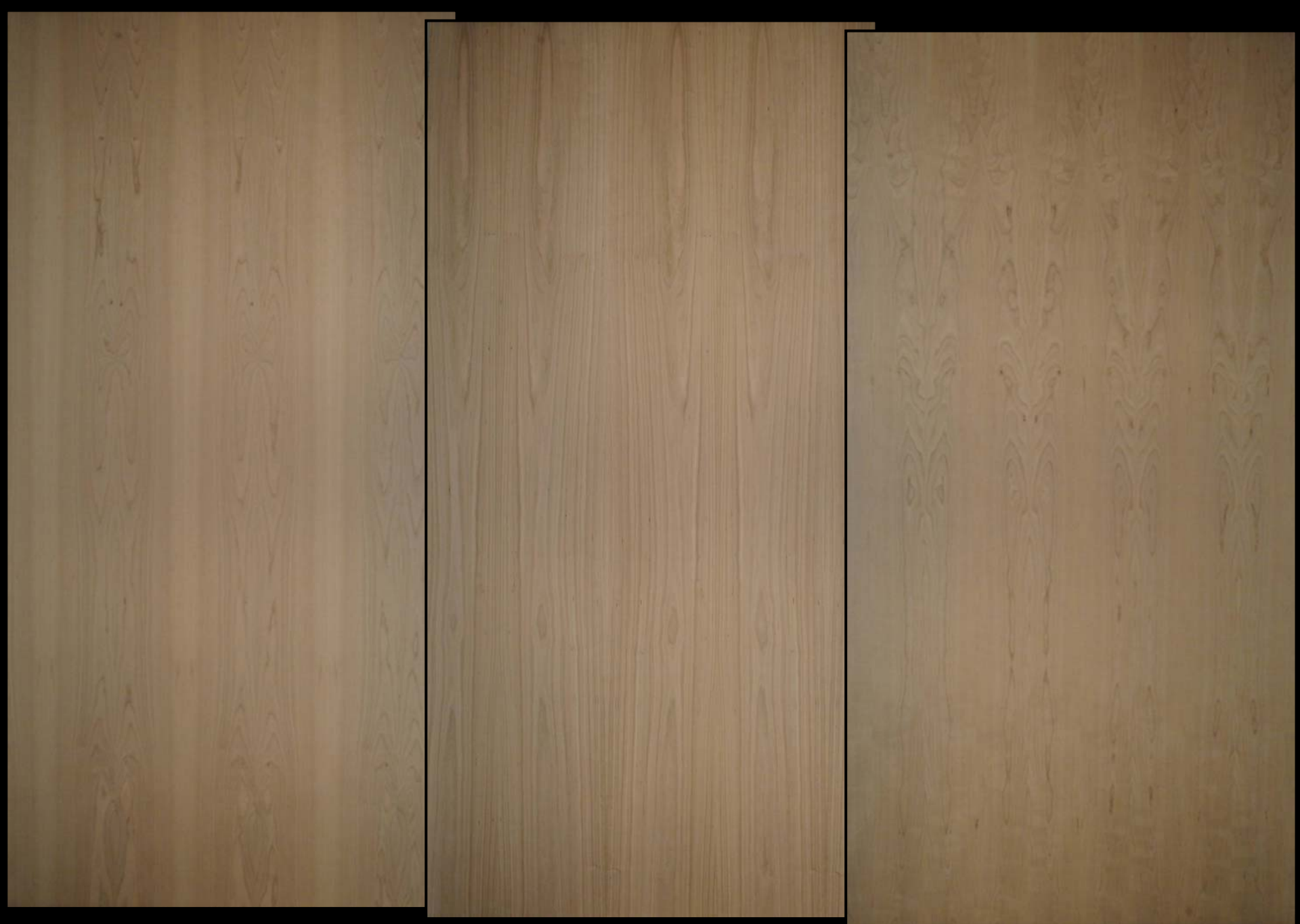
FS CHERRY EXECUTIVE