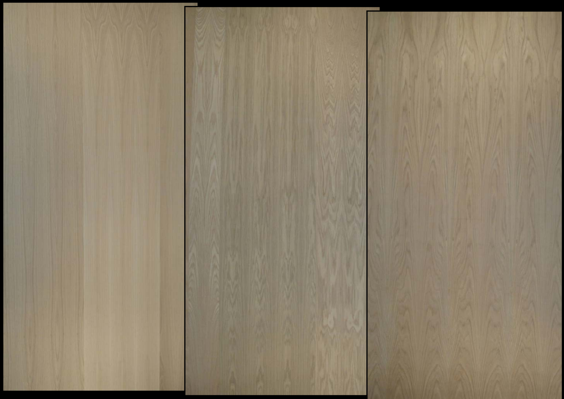
FS WHITE OAK BACK #1