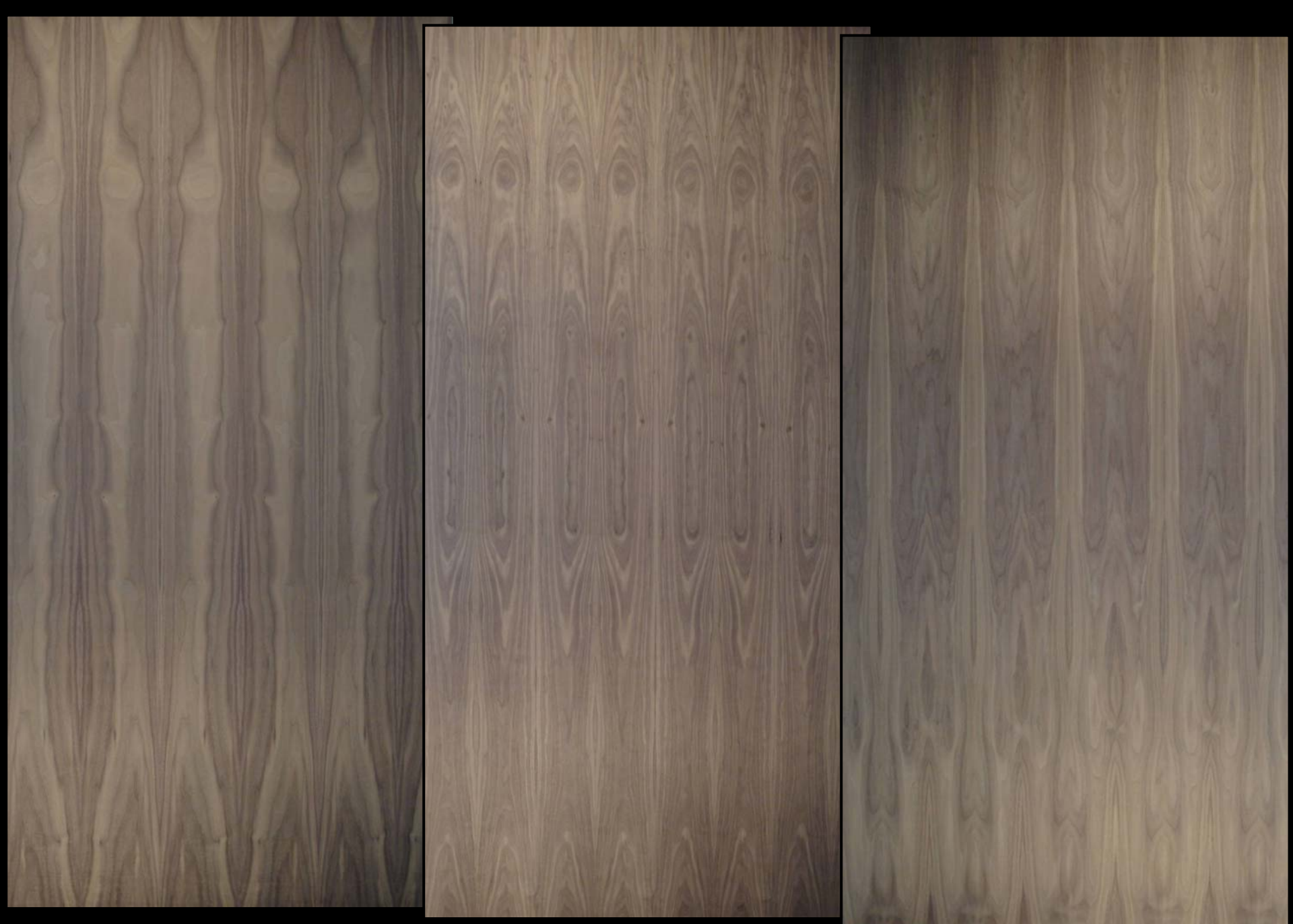
FS WALNUT PLATINUM