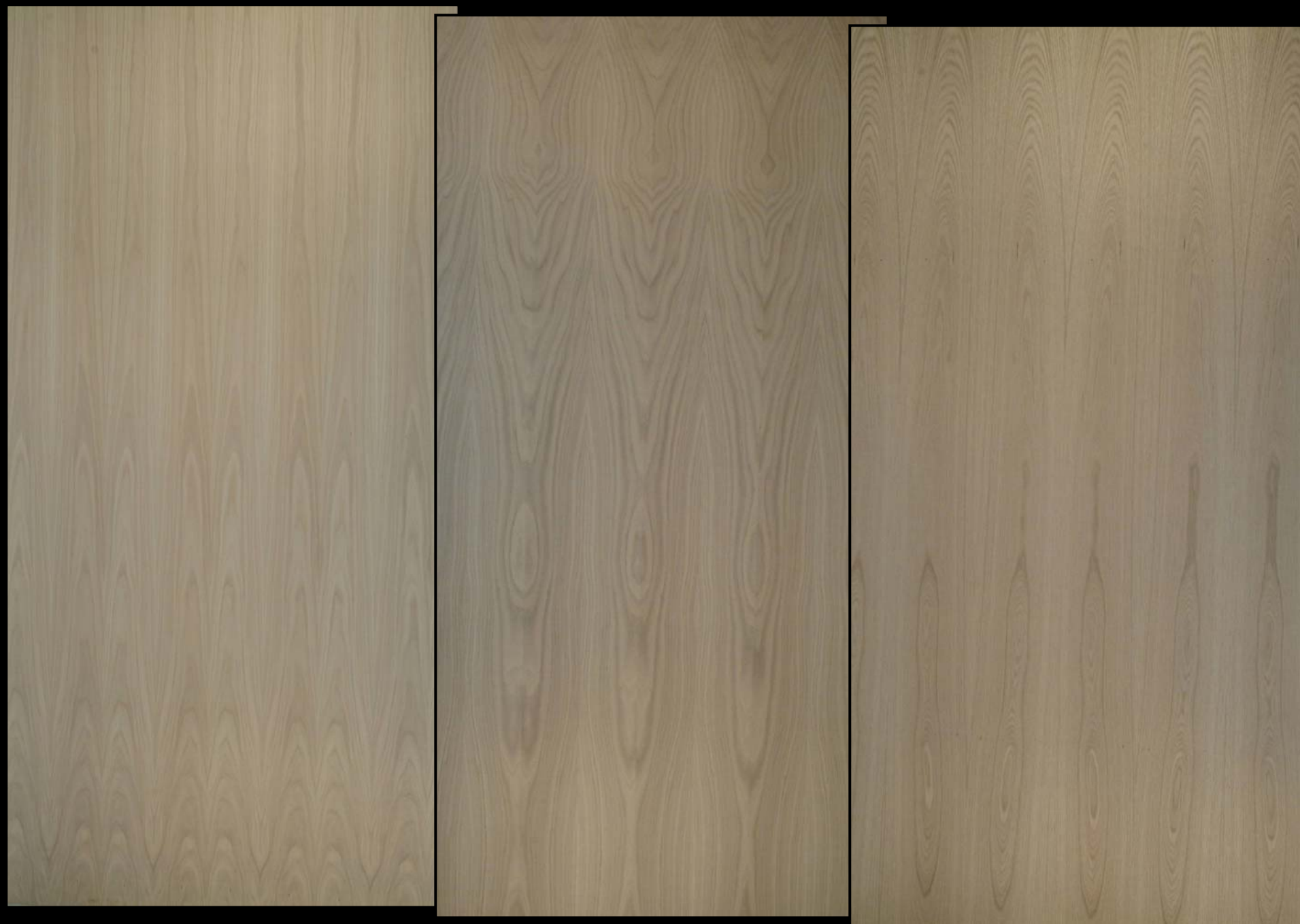
FS WHITE OAK PLATINUM