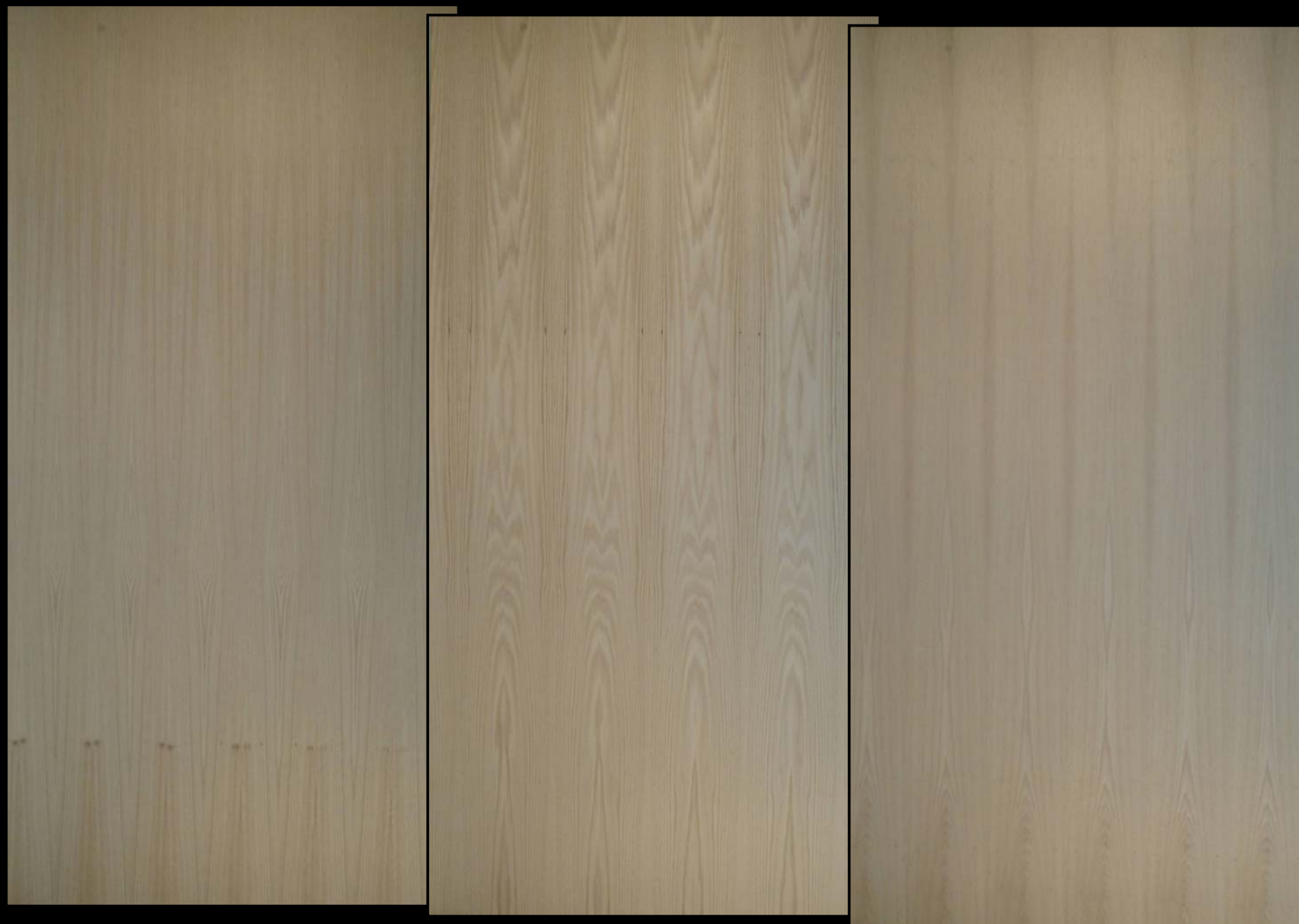
FS RED OAK PERFORMANCE