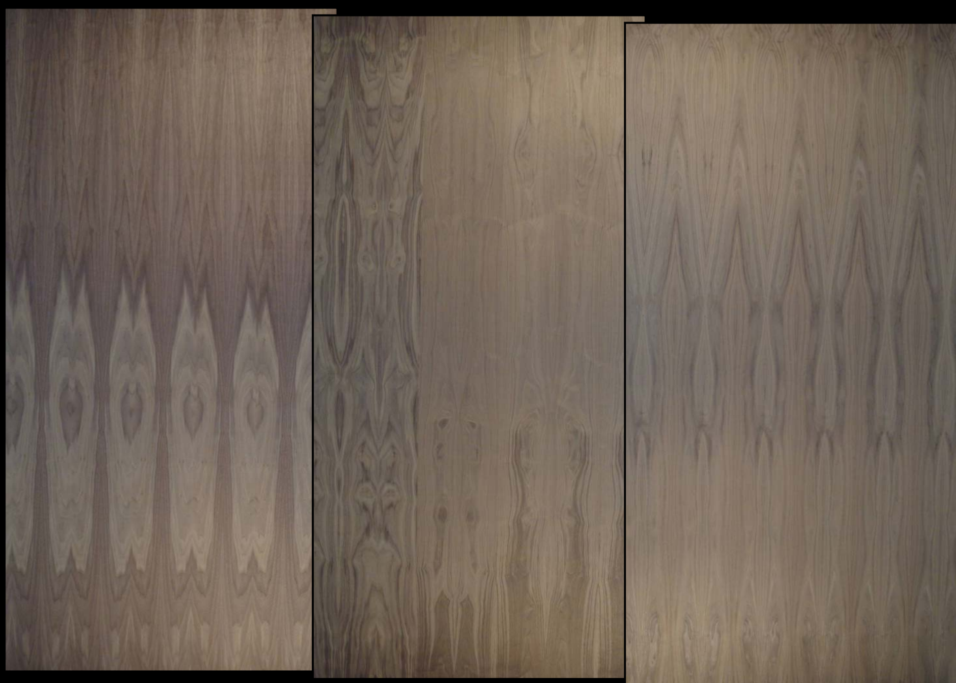
FS WALNUT PERFORMANCE