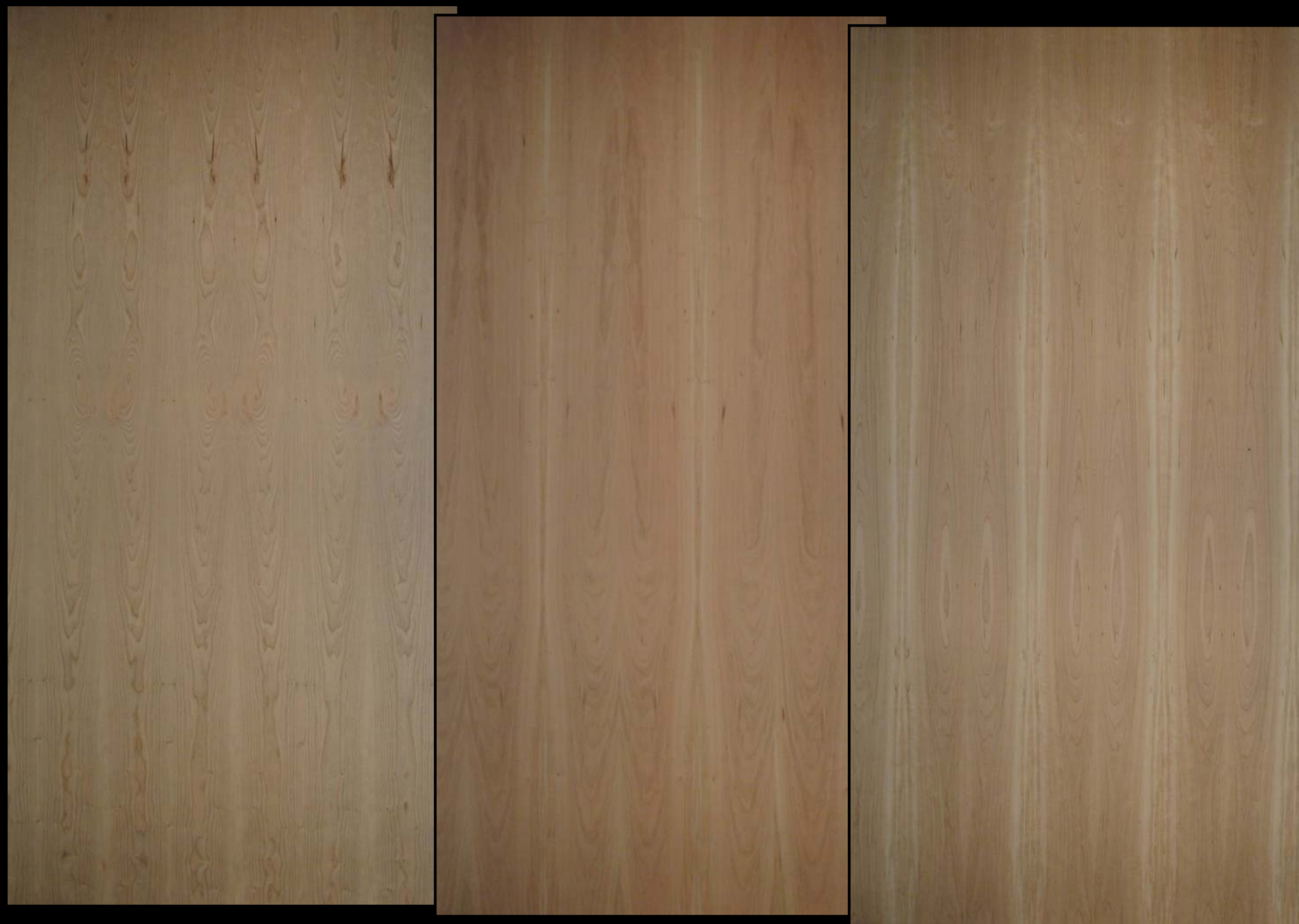
FS CHERRY PERFORMANCE