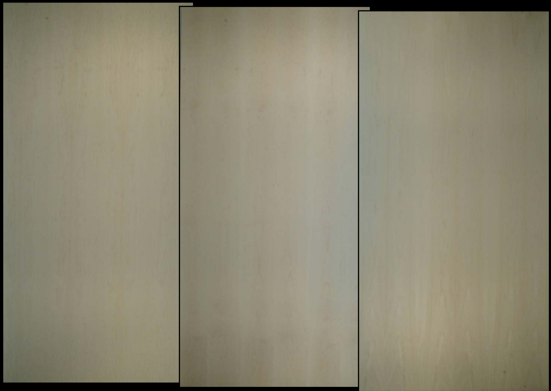
FS MAPLE PERFORMANCE