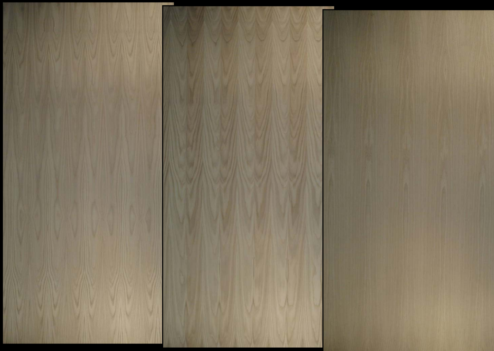
FS WHITE OAK EXECUTIVE