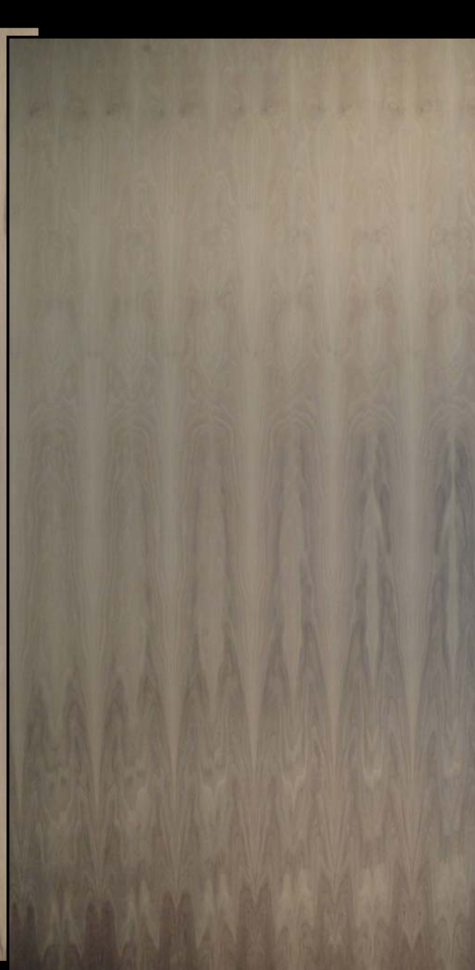
FS WALNUT BACK #1