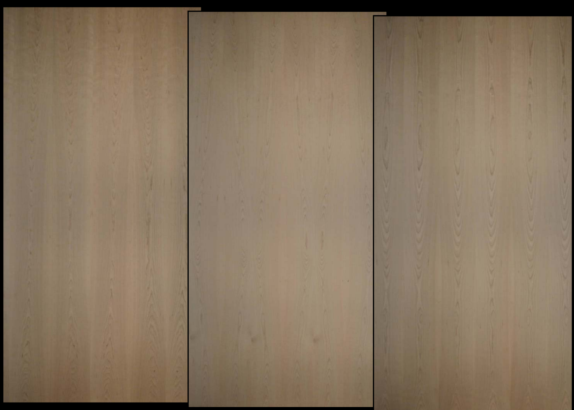
FS CHERRY PLATINUM